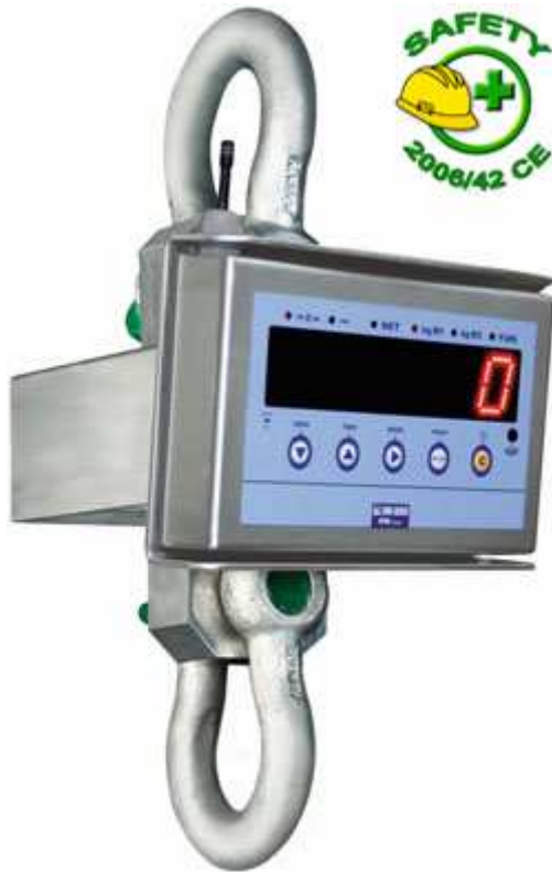
MCW09: IP67 stainless steel crane scales, with optional radio frequency module.

Stainless steel crane scales, with 40mm DOT LED large display, for maximum visibility from all angles and in any lighting condition, including direct sunlight. Sturdy and reliable, usable indoors as well as outdoors. Minimum reduction of the crane's lifting space. IP67 protection against dust and sprays. Fitted with test certificate obtained with sample weights, up to 15000 kg of capacity.