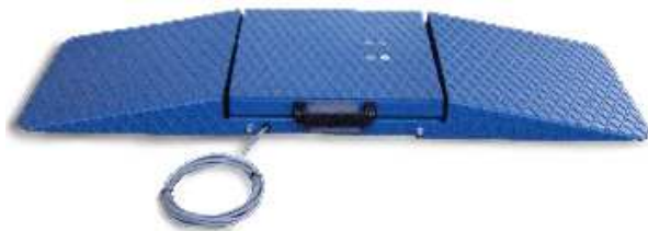
TPS platform with 2 TPSR ramps (optional)