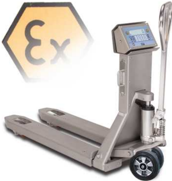
TPWX2GDI: pallet truck scale in STAINLESS steel, for hazardous areas.