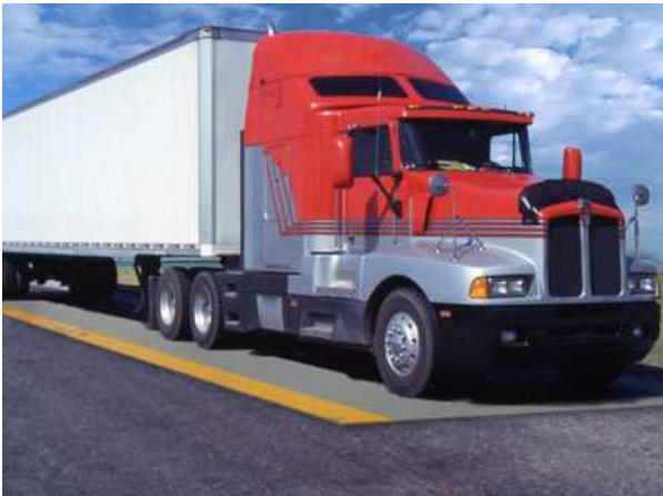
WBSA: modular weigh bridge, flush floor mounted version.